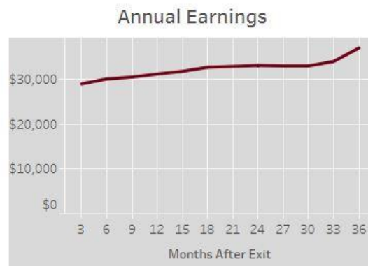
In the three years after leaving WIOA Adults, employed individuals earned $28,900 to $36,900 per year (Statewide, Overall).